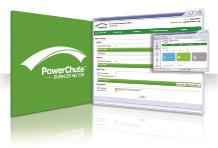
PowerChute Business Edition