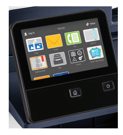
View a demo of our VersaLink device touchscreen at www.xerox.com/ VersaLinkUIDemo.

This unmatched balance of hardware technology and software capability helps everyone who interacts with our VersaLink printers and multifunction printers get more work done, faster.